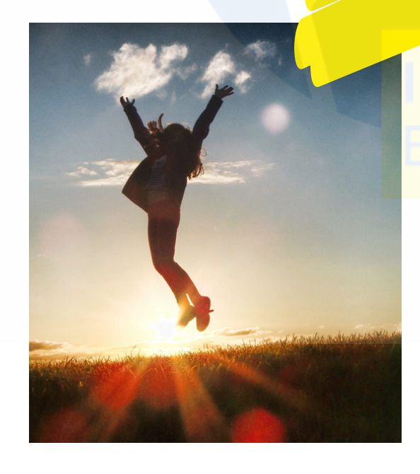
motivated and active personality